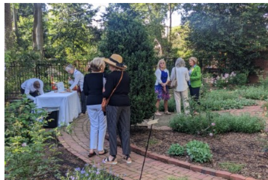
Rosé in the Rose Garden at Sip & See April 2023