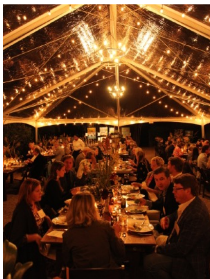
Al Fresco Fall Dinner October 2022