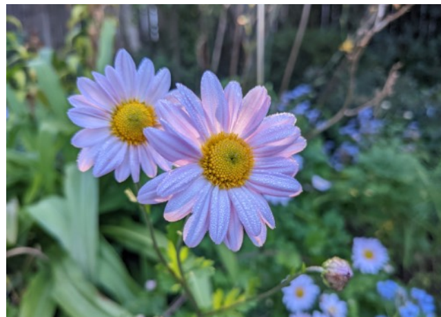
Morning dew on Chrysanthemum "Little Pink Daisy" at the Elizabeth Lawrence House & Garden

HELPFUL INFORMATION FOR ESTATE PLANNING ATTORNEYS, ACCOUNTANTS AND FINANCIAL ADVISORS