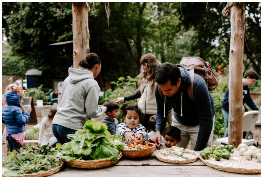
Families explore the bounty of the Children's Garden during "Harvest at the Haven."

Atlantic Landscape Supplies, Inc. Bartlett Tree Experts Lat Purser & Associates, Inc. Super Sod