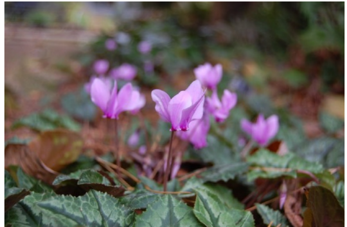
Original corms of fall-blooming hardy cyclamen ( Cyclamen hederifolium ) grow in the gardens of both Elizabeths to this day, showing their keen botanical interests.