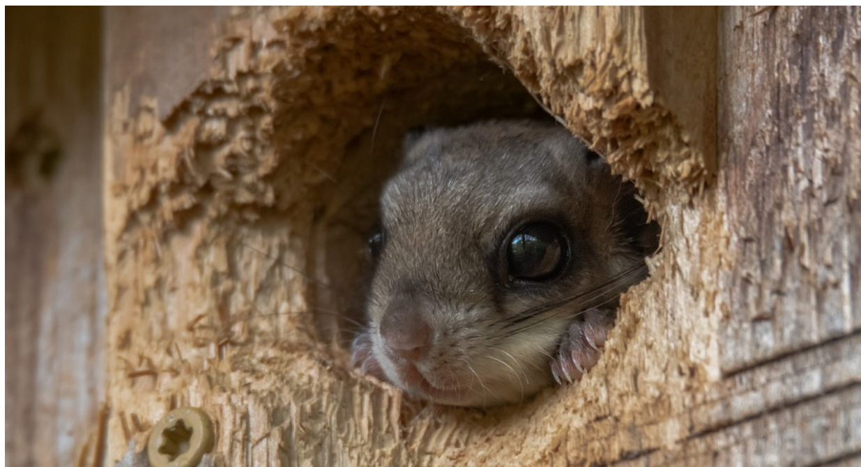
A flying squirrel peeks out from a nesting box at Wing Haven Garden & Bird Sanctuary.