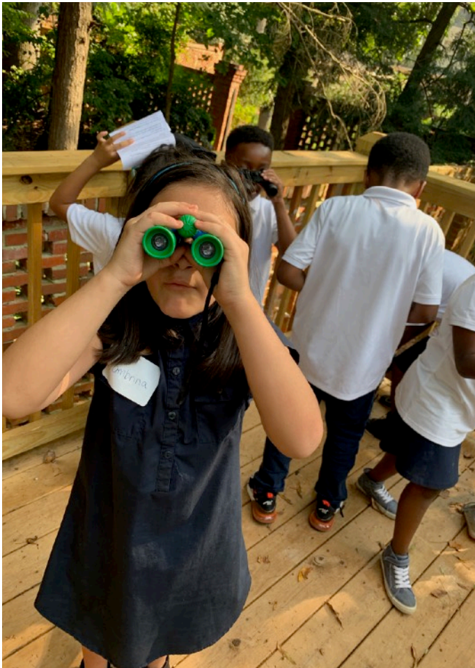
We see you! The wildlife observation platform is the perfect place to search for birds and other wildlife.

And yet, those who diligently plant, water, and weed in the SEED Wildlife Garden are not the only caretakers at work—there are also those essential caretakers who, like the garden itself, are just now growing up. The many children who create art, explore plant life, identify wildlife, and listen for birdsong in the SEED Wildlife Garden are creating powerful relationships with the natural world in the process. In 50 years, we may not remember the many caretakers—students, volunteers and staff—who have given their time to the SEED Wildlife Garden in the same way that we remember Eddie and Elizabeth Clarkson or Elizabeth Lawrence today. It is our hope, however, that the children who have been impacted by the power of gardening at Wing Haven will carry with them the lessons of caretaking, equipped to care deeply for the land in their own corners of the world.