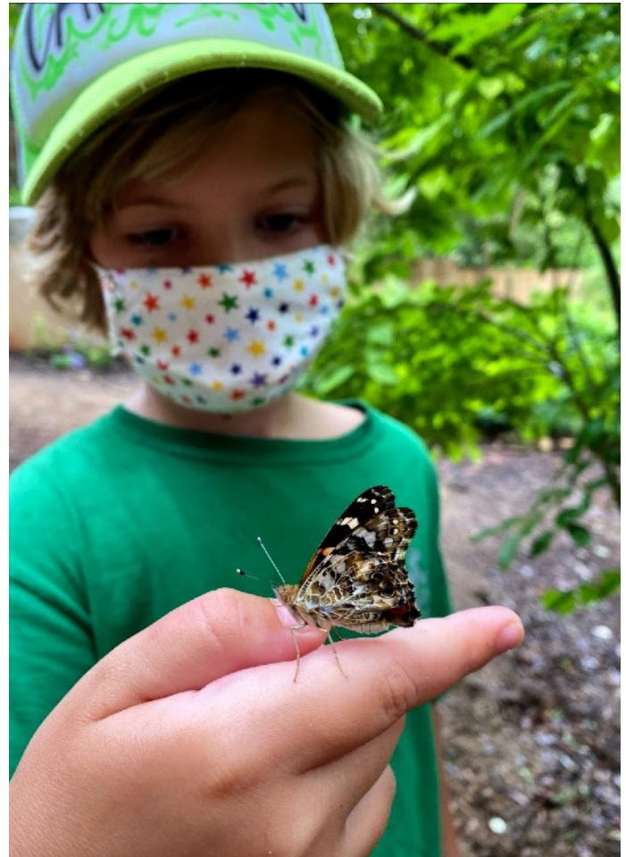
In a moment of magic, a painted lady butterfly ( Vanessa cardui ) lights on a young man's finger.