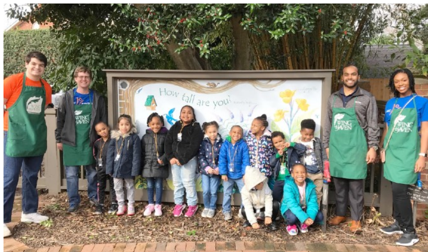
We love our PEEPs (Preschool Environmental Education Program)! PEEPs groups enjoy learning in the Children's Garden.