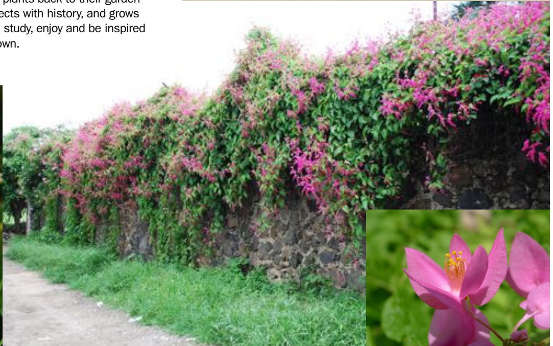
Elizabeth and Eddie Clarkson, pictured in 1930, standing in front of a weeping willow in the corner of the Main Garden—a tree that surely brought memories of their courtship in Boston. A stone wall in Mexico covered in coral vine ( Antigonon leptopus ) Inset: coral vine flower detail. Milk and wine crinum lily ( Crinum herbortii )